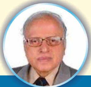
Prof. M. S. Swaminathan Founder Chairman, MSSRF, Chennai, Tamil Nadu